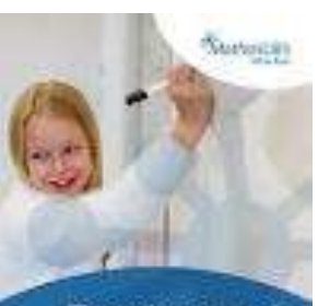
There's no such thing as a maths person

Did you know that your experience of maths has an impact on your child's confidence in the subject? Girls, especially, are influenced by their mothers and female relatives. Any negative impressions can be passed down and affect a student's self-belief and success rate.